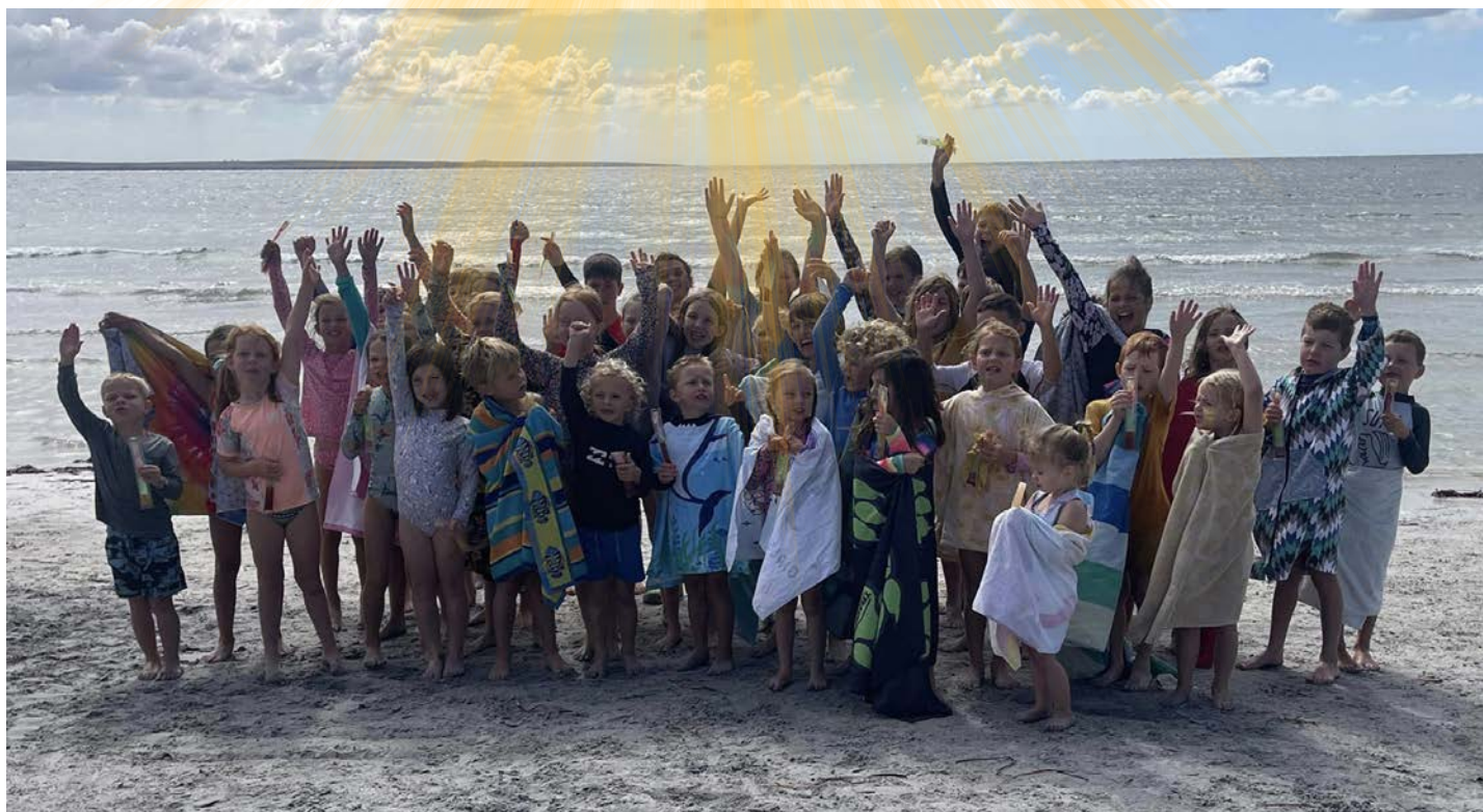
Port Neill & Ungarra Students