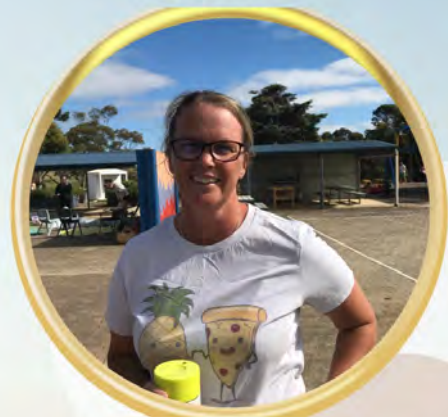
STUDENT WELLBEING SUPPORT WORKER

MY FIRST DAY AT PORT NEILL PRIMARY SCHOOL WAS REALLY EXCITING AND I CAN'T WAIT TO GET INTO THE ROLE OF STUDENT WELLBEING SUPPORT OFFICER. I WILL BE WORKING MAINLY ON FRIDAYS WITH A LOT OF PROJECTS ON THE GO INCLUDING SUPPORTING PEOPLE WITH THE RELISH PROGRAM, BREAKFAST CLUB, LUNCHTIME ACTIVITIES, AND CHILDRENS UNIVERSITY PASSPORTS.