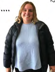
Miss Laete for all your help & expertise

everyone who held a stall, donated items for our trading table or helped at the markets in any way.