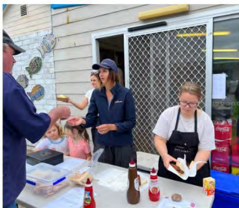
Governing Council and Parents