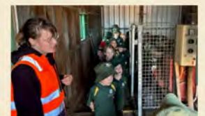
Having a look at the generator, which is currently out of action.