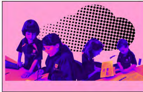
Tuck & Gypsy