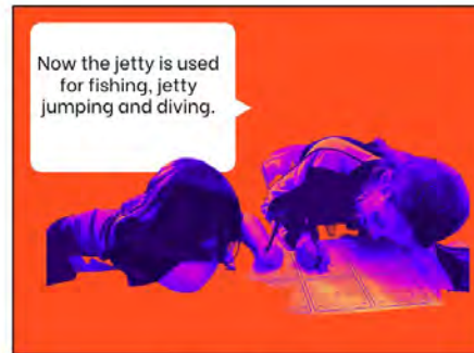
Scout & Caitlin