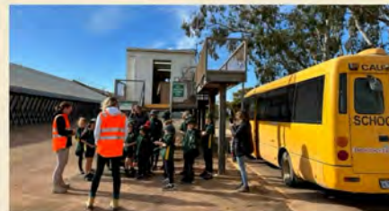
Testing out the weigh bridge